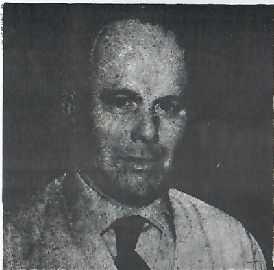
ROY FISHER Sketches